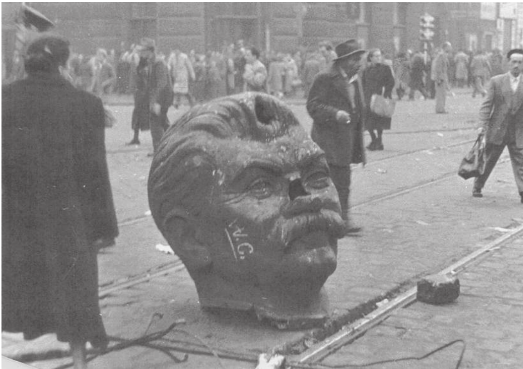
A photograph taken in Budapest, October 1956.