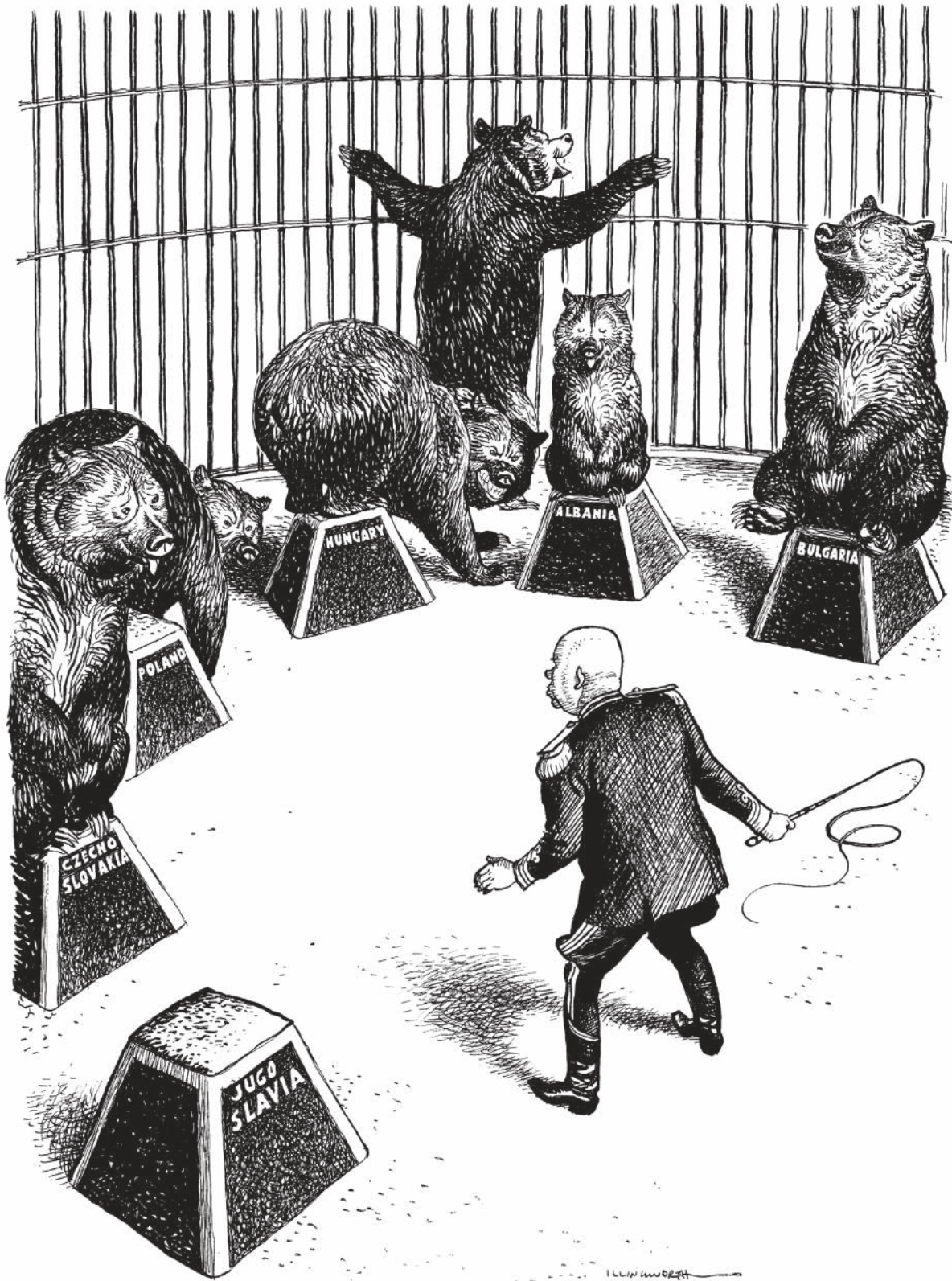
A British cartoon published on 31 October 1956. The figure with the whip is Khrushchev.