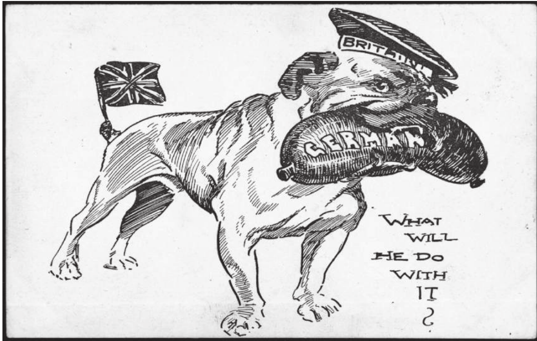
A British postcard, 1914.