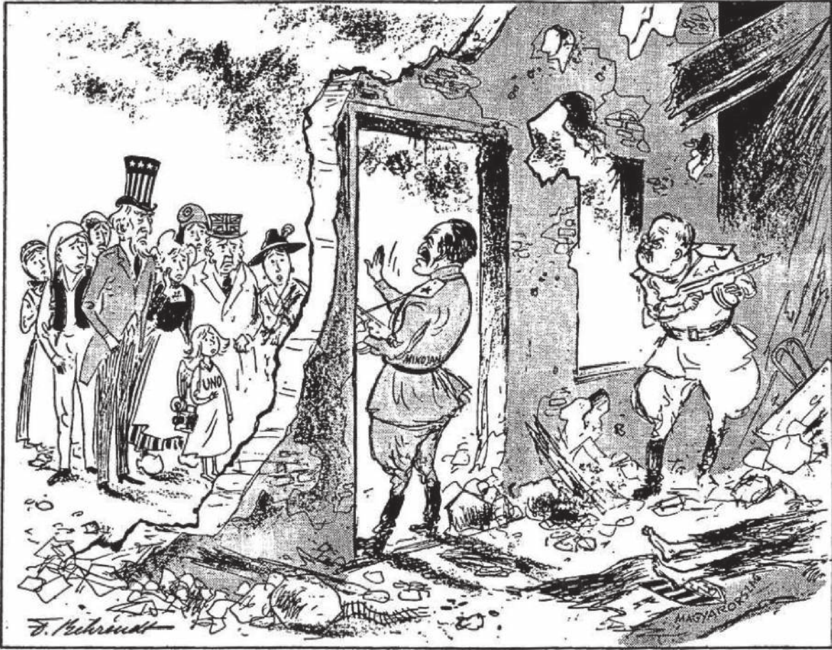
A cartoon published in Holland in November 1956. The Soviet soldier is saying 'This is a purely Hungarian matter.'